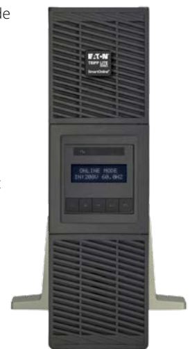
Mount the UPS in a rack or use the included tower stands for vertical placement.

Eaton provides free product support via phone, email or chat. If you have a question or need to find a replacement battery, Eaton can help.