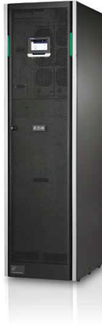
93PS three phase UPS with Internal Battery