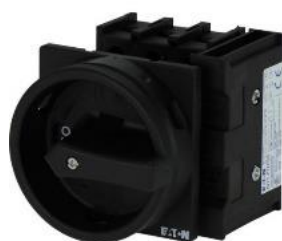
P1 Switch Disconnecter with Flush Mount & Neutral block